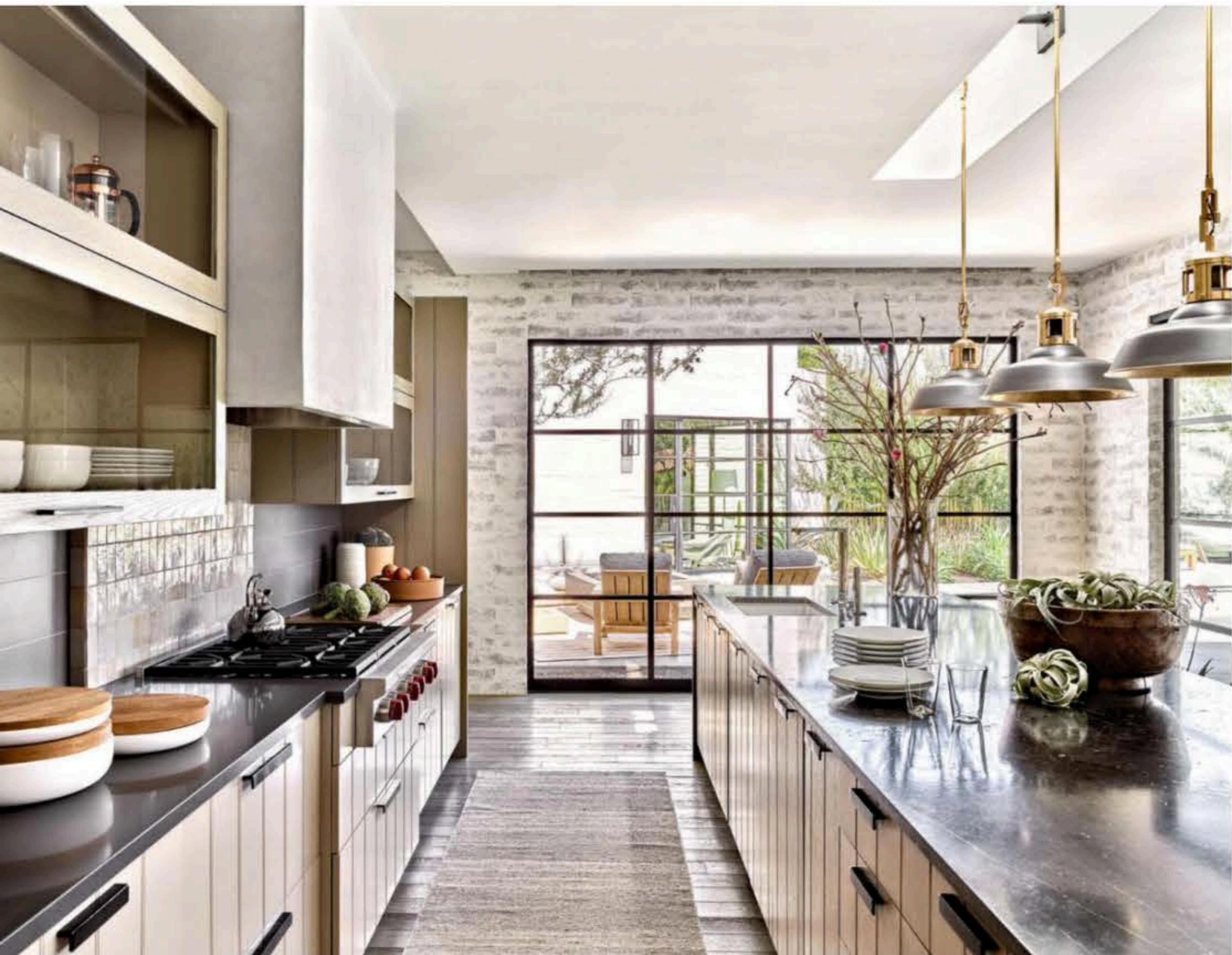
Above: To ensure the modern kitchen still felt warm, the designer employed Belgian bluestone counters and a glazed Moroccan tile backsplash. A custom triple pendant light by The Urban Electric Co. is suspended over the island.