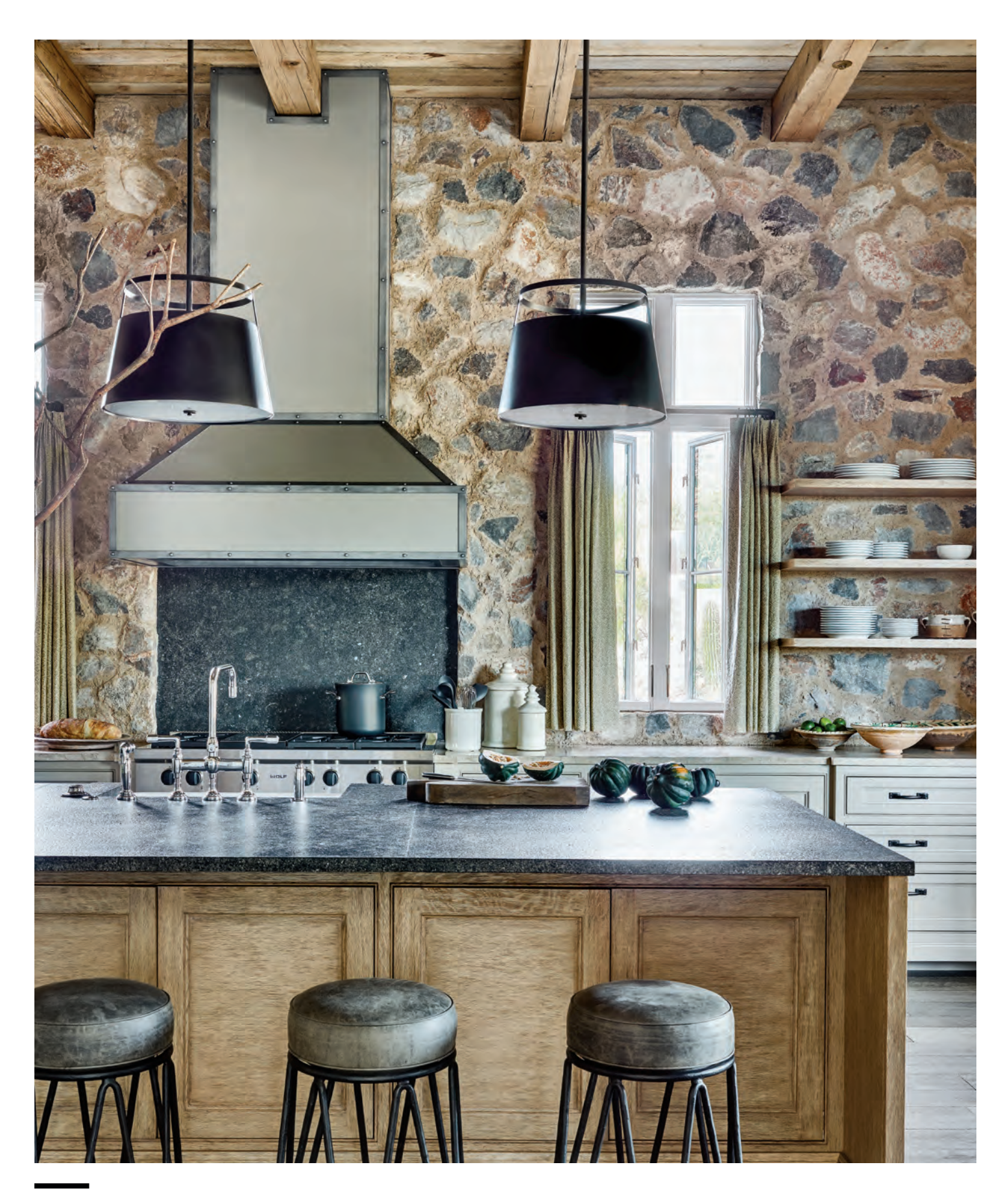
A stone wall and a salvaged wood ceiling give a rustic character to the kitchen, where flamed and brushed granite from Exquisite Surfaces makes up the countertops as well as the backsplash behind the range. The pendant lighting is from The Urban Electric Co. in Charleston, South Carolina, and the Mattaliano barstools are from John Brooks Incorporated.