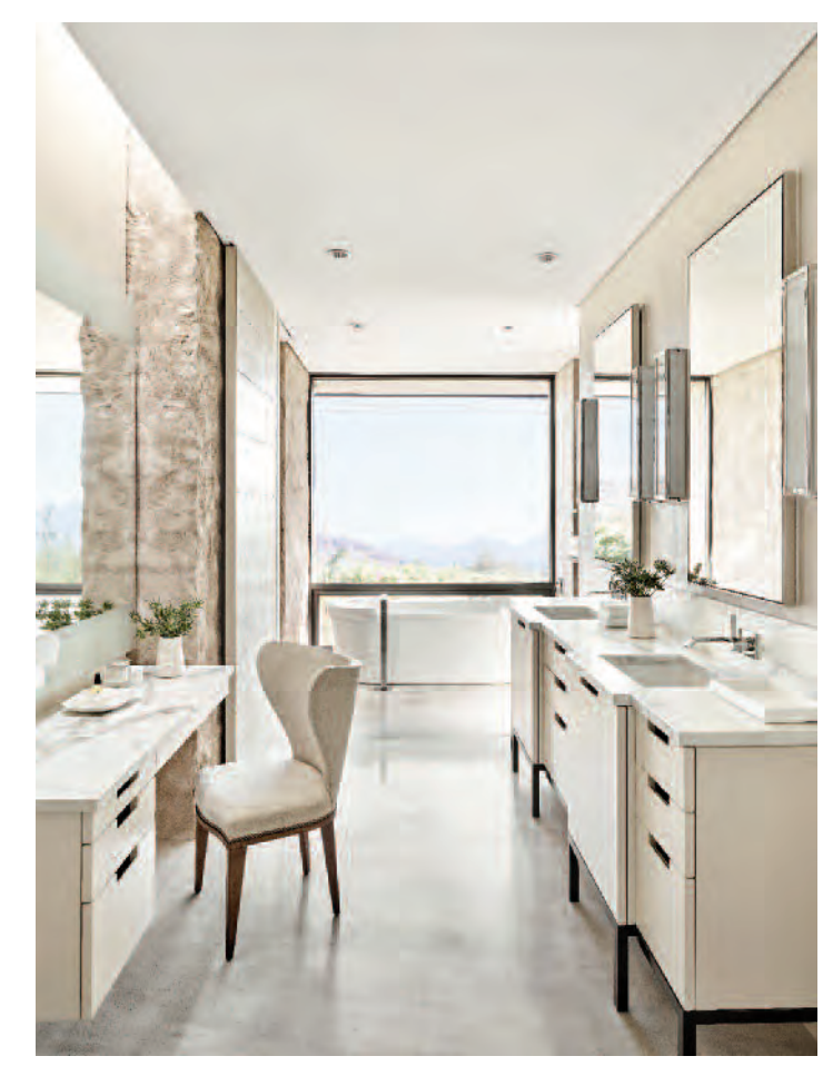
(Shown above and right) Dornbracht faucets and Philippe Starck for Duravit tub from Clyde Hardware; Fleetwood windows and doors through Sienna Custom Window and Door; rugs from David E. Adler.

A room from another view, this primary suite clearly shows just how sophisticated this home really is.