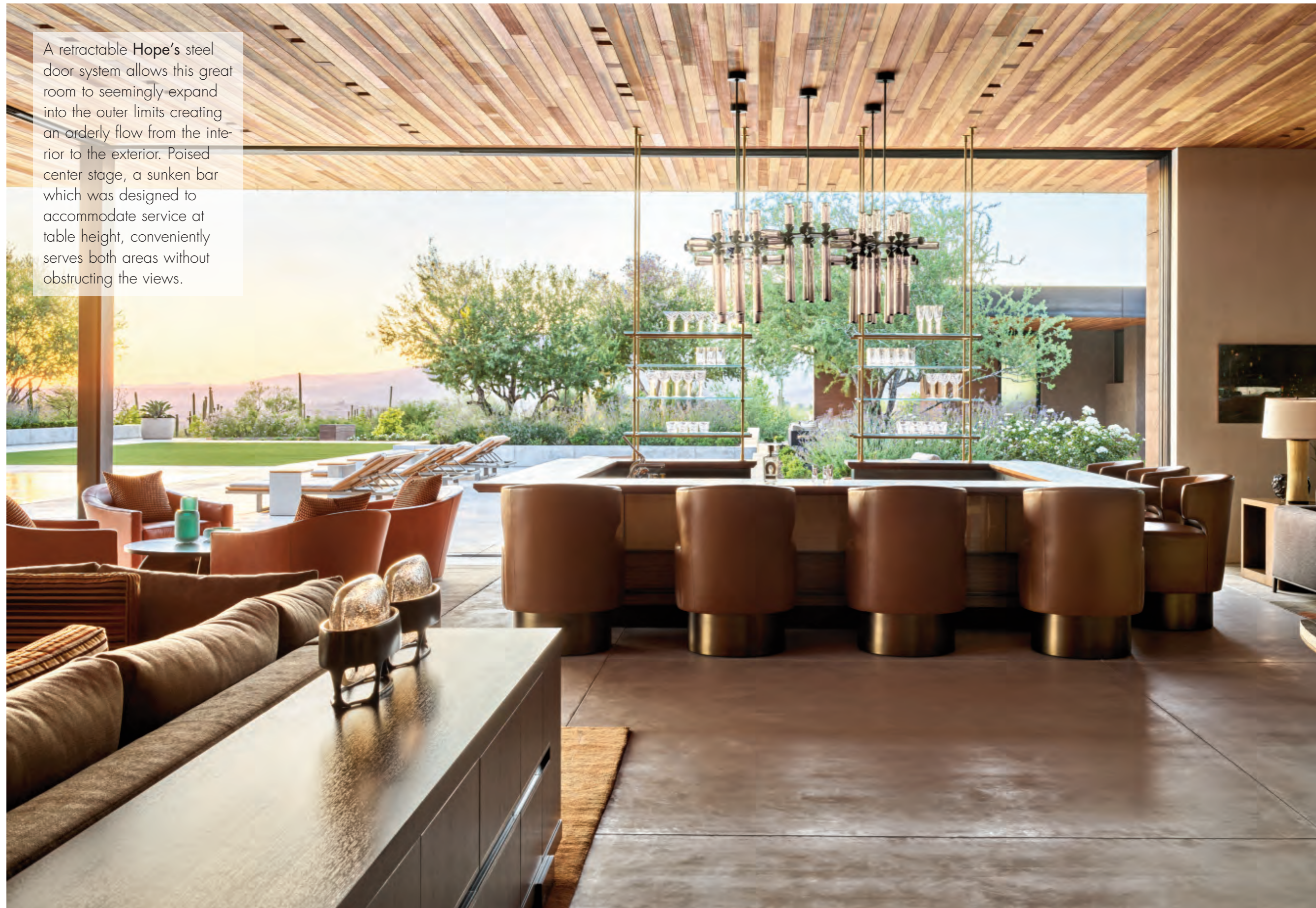
Holly Hunt Sevilla lounge chairs in leather create a wonderful conversation area, while her Mesa occasional chairs flanking the bar are at once practical, stylish and comfortable. Available through Trade Professionals at John Brooks .

A retractable Hope's steel door system allows this great room to seemingly expand into the outer limits creating an orderly flow from the interior to the exterior. Poised center stage, a sunken bar which was designed to accommodate service at table height, conveniently serves both areas without obstructing the views.